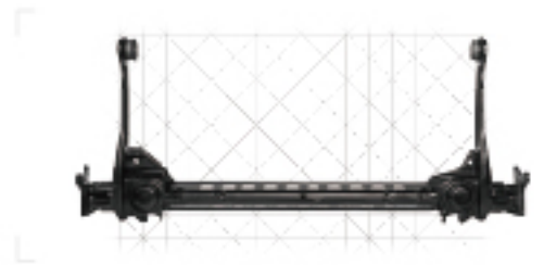
后扭力梁总成 Rear Axle Beam