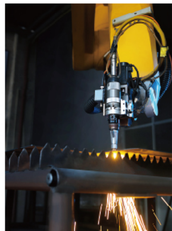
◀ 3D 激光切割机 3D Laser Cutter