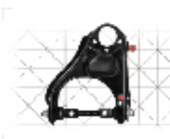
悬挂臂 Control Arm