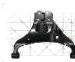
悬挂臂 Control Arm