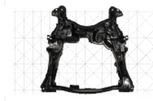
发动机托架总成 Front Frame