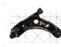
悬挂臂 Control Arm