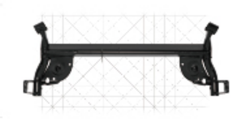
后扭力梁总成 Rear Axle Beam