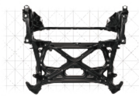
发动机托架总成 Front Frame