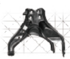
悬挂臂 Control Arm